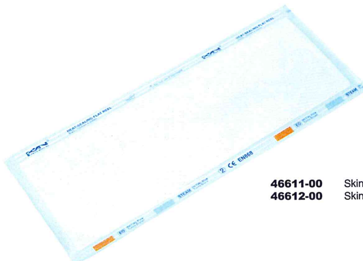
46611-00 Skin graft carrier > 1,5:1 (Box of 20) 46612-00 Skin graft carrier > 3:1 (Box of 20)